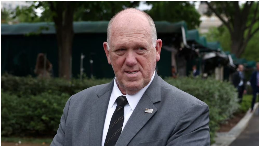
Border Czar Tom Homan demanded an investigation into CNN over its coverage of the app.

“This is horrendous that a national media outlet would be out there trying to forecast law enforcement operations throughout the country,” Homan went on. “It’s incredible where we’re at as a country and I think the [Department of Justice] needs to look at this and see if they crossed a line.”