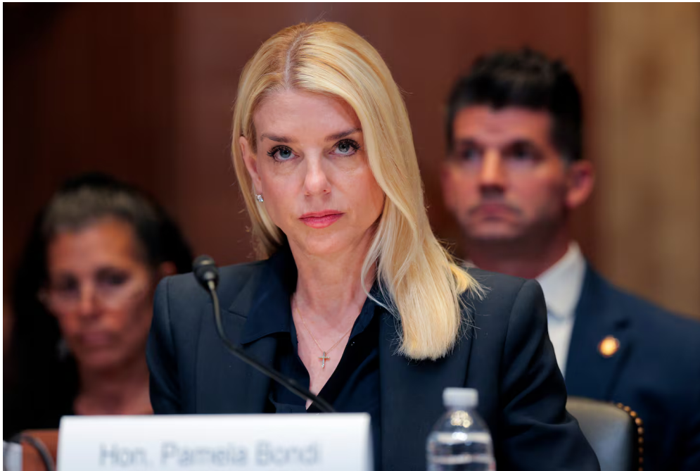
Attorney General Pam Bondi has called CNN's coverage "shameful" and warned the app's creator the DOJ will be looking into him.